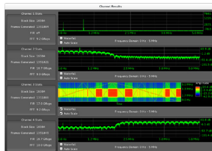
AXIS RuntimeView screen shot – multi-threaded application on dual Intel Core-7 processor.

The AXISPro-01M development environment supports application optimization on multi-core, multi-threaded and multi-node distributed system architectures across multiple operating systems including Linux, Windows and VxWorks and includes quick start signal and image processing examples to accelerate time-to-solution.